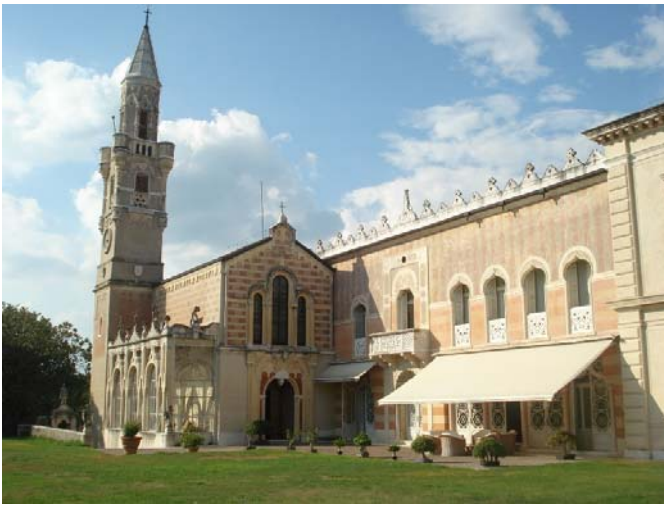
VILLA MUSELLA: Photos