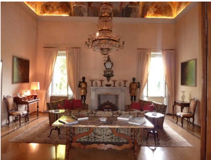
VILLA MUSELLA: Photos